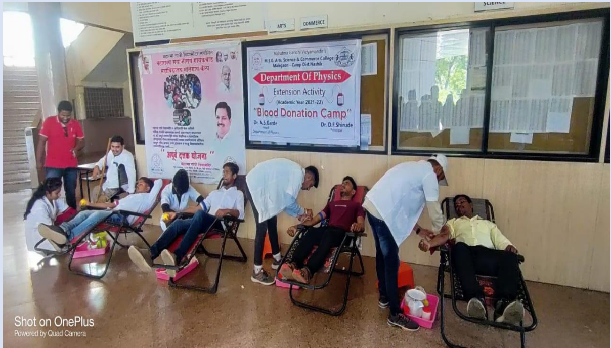
Shot on OnePlus Powered by Quad Camera